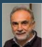
Giuseppe Remuzzi Italy